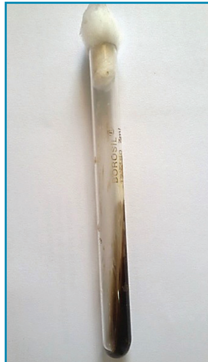
Fig. 4: Bile esculin agar showing hydrolysis of esculin by the organism.

intermittent in nature reaching 100° F accompanied by chills and rigor with sweating. The child had occasional cough lasting <1sec, 2-3 bouts/episode, 10-12 episodes/day with occasional projectile vomiting