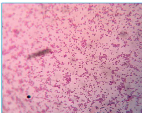
Fig. 2: Gram stained preparation showing gram positive pleomorphic coccobacilli.