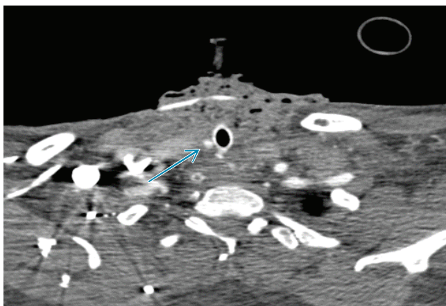
Fig. 2: Post-contrast axial image cephalad to the previous image shows a section of tracheal tube as it enters the trachea. Small discrete foci (at least three) of avid contrast enhancement are seen on soft tissue posterior and right posterolateral aspect of the tracheostomy tube (straight arrow). This is in the tracheal wall around the tracheostomy tube.