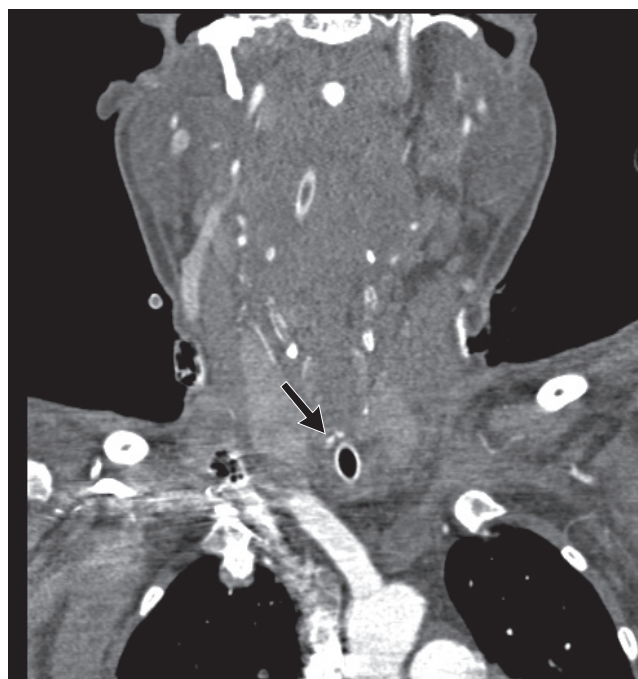
Fig. 4: Coronal section slightly anterior to the previous one shows more contrast-enhanced foci in the tracheal wall superior aspect of the tracheal tube.