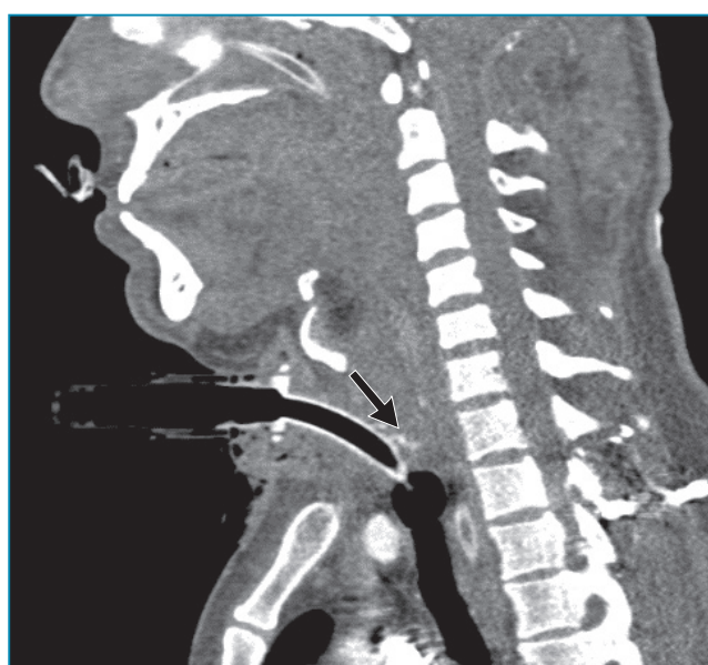
Fig. 5: Sagittal images at the level of the trachea again show tracheostomy tube with an inflated balloon in the trachea. Cross section of the Innominate artery is seen anterior to the trachea and nasogastric tube is seen posteriorly in the esophagus. Contrast enhancing foci (straight arrow) is seen posterior to the tracheal tube superiorly in the tracheal soft tissue.

To prevent the formation of granulation tissues we should avoid excess mechanical irritation, use proper sized tube; swivel apparatus and ventilator tubing support. Prevention of stomal infection is important because infection may impair tissue healing. Meticulous care of stoma should be done for prevention of bacterial contamination. 13