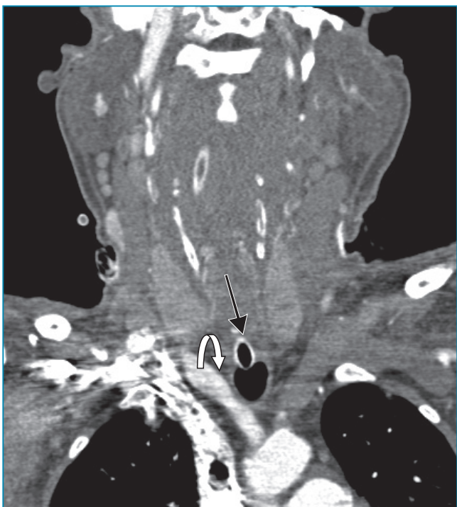
Fig. 3: Coronal reformation images at the level of the tracheal tube again show inflated balloon (straight arrow) inside the trachea passing in close approximation to the innominate artery on the right (curved arrow). No fistulous communication is seen between the trachea and the surrounding artery. No extravasation of contrast into the trachea/tracheostomy tube is seen. Small contrast enhancing focus seen in the superior aspect of the tracheal tube section corresponds to the focus seen on the axial images.